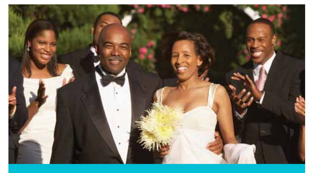
Here's How LifeTime Benefit Term Works

Coverage is available for your spouse, children and dependent grandchildren.